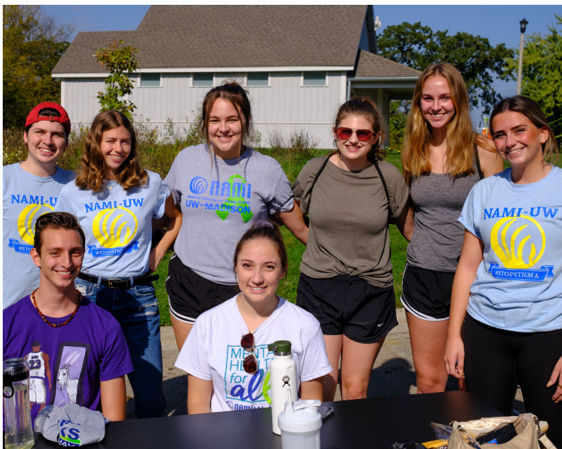
NAMI UW Walk Team 2021